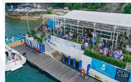
Middle Island, Aberdeen Boat Club