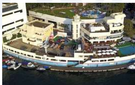
Wong Chuk Hang, Aberdeen Boat Club