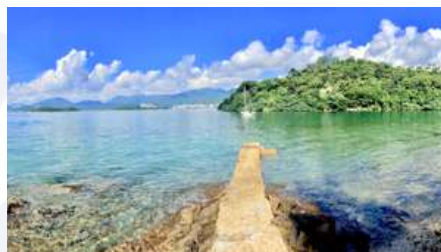
Emerald Bay, VRC