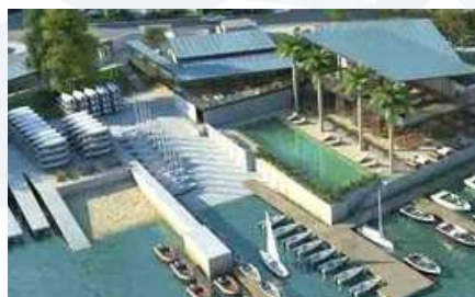
Pak Sha Wan, Hebe Haven Yacht Club