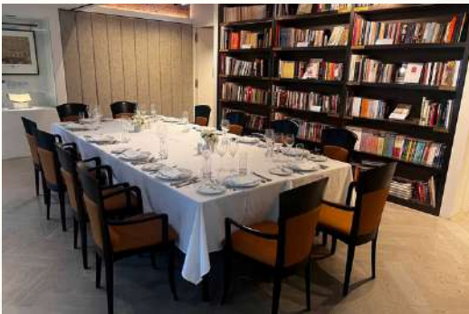
Maximum Capacity: 24pax (Dining Seated)

An exclusive multi-purpose venue for celebrations, dining and meetings