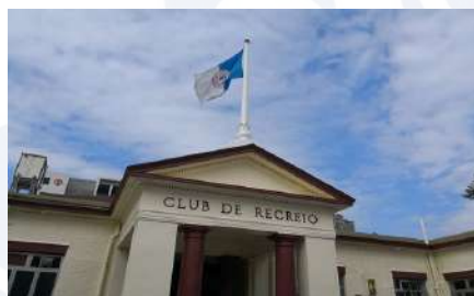
King's Park, Club de Recreio