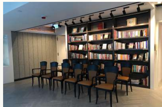
Maximum Capacity: 30pax (Auditorium Style)