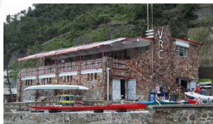
Deepwater Bay, VRC