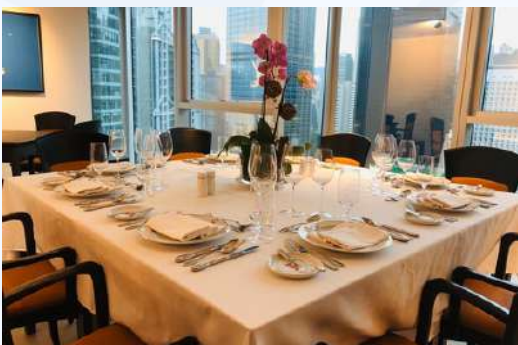
Maximum Capacity: 12pax (Dining Seated)

A cozy venue ideal for small gatherings, meetings, cards or mahjong games